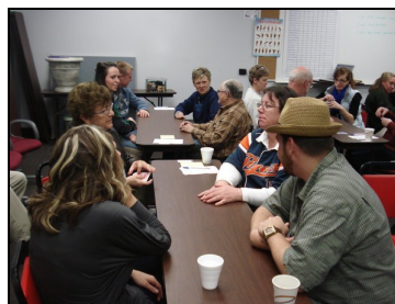
People play in the euchre tournament, hoping to score high points!