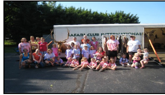
Gearing up the Kammers for 2010 Kamp!

Kids Kamp is open to deaf, hard of hearing, or hearing children, children of Deaf