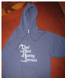
$20 each. S, M, L, XL sizes available